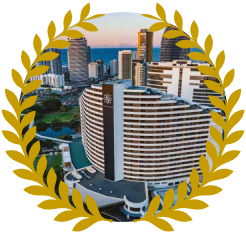
STAR POKER GOLD COAST