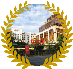
NEWPORT WORLD RESORTS