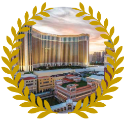
SANDS CHINA LIMITED FOR THE VENETIAN MACAO