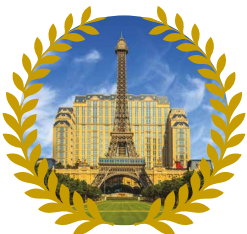
SANDS CHINA FOR THE PARISIAN MACAO