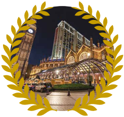
SANDS CHINA FOR THE LONDONER MACAO