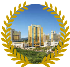
RAFFLES AT GALAXY MACAU