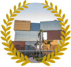
MGM COTAI POKER ROOM