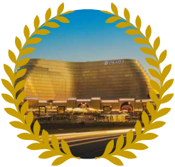
POKERSTARS AT OKADA MANILA