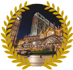
LONDONER COURT AT THE LONDONER MACAO