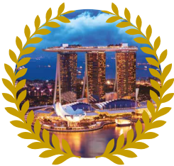
THE MARINA BAY SANDS HOTEL