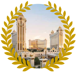
GALAXY ENTERTAINMENT GROUP FOR GALAXY MACAU