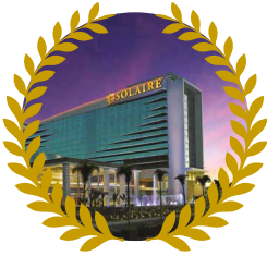
BLOOMBERRY RESORTS CORPORATION