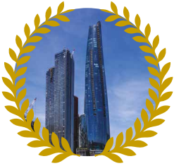
CROWN RESORTS FOR CROWN SYDNEY