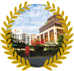
NEWPORT WORLD RESORTS POKER ROOM