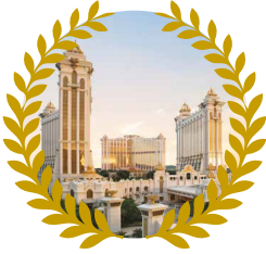
GALAXY ENTERTAINMENT GROUP FOR GALAXY MACAU