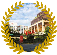
HOTEL OKURA MANILA AT NEWPORT WORLD RESORTS