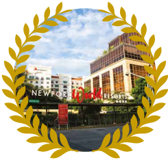
NEWPORT WORLD RESORTS