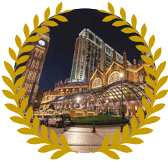
SANDS CHINA LIMITED FOR THE LONDONER MACAO