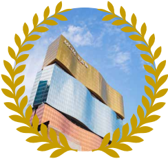
MGM CHINA LIMITED