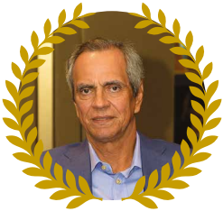
MR ENRIQUE RAZON BLOOMBERRY RESORTS CORPORATION